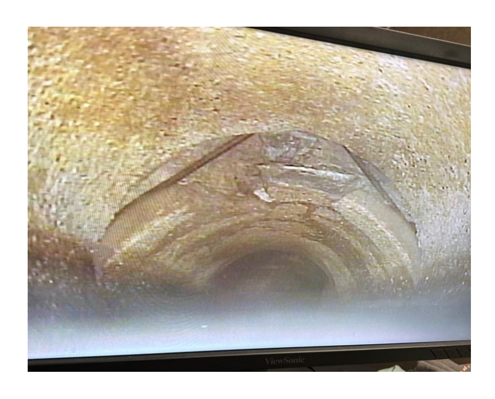
Fig. 1 – Failed concrete sewer pipe