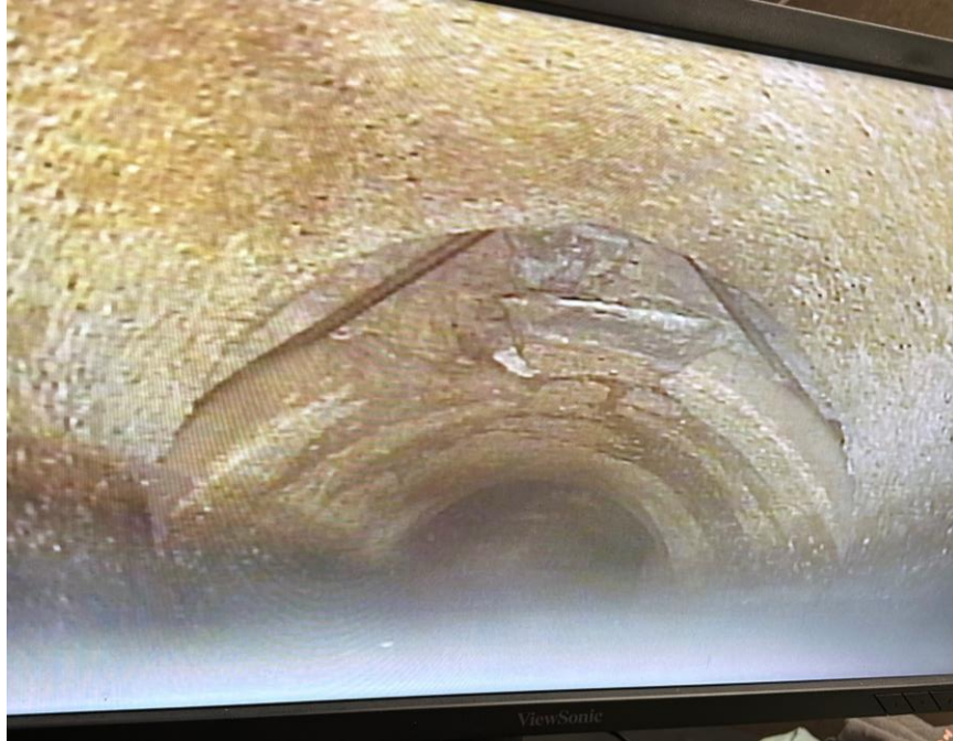
Fig. 1 – Failed concrete sewer pipe